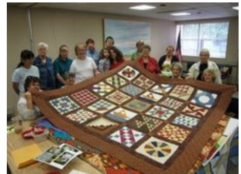
One of the many quilts raffled off to benefit the Abington Community Library.

Check our website for details on confirmed at home businesses to be represented. Admission is free. Hope to see you there!